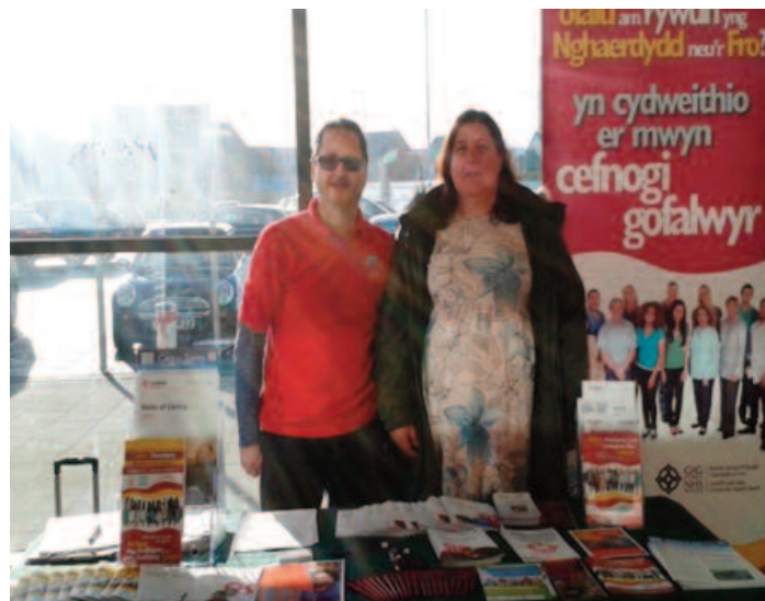
Carers Rights Day Event, Asda Barry

In November 2017, to celebrate Carers Rights Day, the Patient Experience Team joined by the Carers Lead from Cardiff Local Authority, hosted in a stand in UHW Concourse. In Barry the Vale's Carer Development Officer, joined by the Carers Wales South East Trust Engagement Officer, also held an information stand in the foyer of Asda.