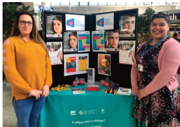
Young Carers Awareness Day Event with YMCA

In January 2018 Young Carers Awareness Day was celebrated. The Patient Experience Team hosted a stand, in Concourse UHW, alongside the YMCA and the Vale held an information display in Barry Library. The aim was to raise awareness of young carers and the services that provide them support.