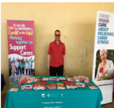
Vale Carer Development Officer at Vale of Glamorgan Event

The week also included two larger events across Cardiff and the Vale of Glamorgan. The first event was held by the Vale of Glamorgan Council, in partnership with organisations who support carers. Carers were invited to come down to the promenade on Barry Island waterfront to meet with the organisations, who were at hand to offer information, support and advice.