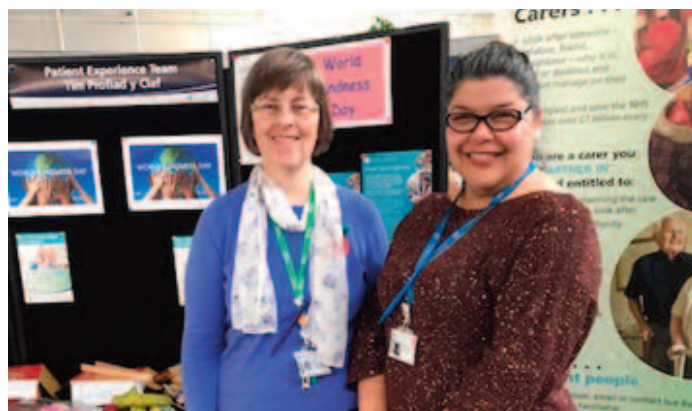
World Kindness Day Event, Concourse UHW

Between May 2017 and May 2018 the Patient Experience Team have attended and provided information at eleven community events across Cardiff and the Vale and hosted seven events across the Cardiff and Vale University Health Board sites. This is in addition to the events run by both the Local Authorities.