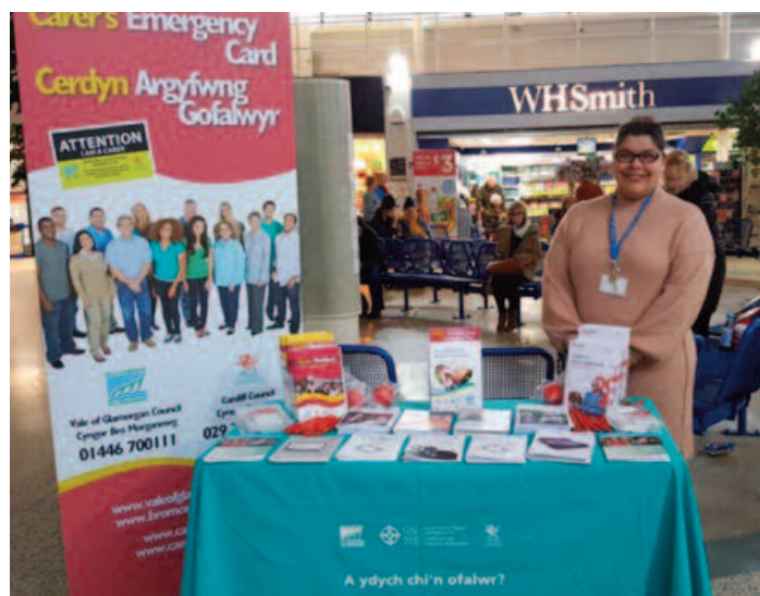
Carers Rights Day Event, UHW

During the events carers and staff were signposted to sources of information and support as well as being offered practical advice.