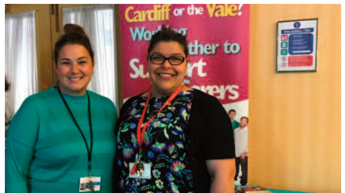
Cardiff and Vale Health Board and Cardiff Adult Social Services teams at Cardiff Carers Feedback event, City Hall

The second was a feedback event held in conjunction with Carers Wales South East Trust (CWSET). The event was a chance for carers who had been involved in the CWSET engagement project to share their ideas on how they would like to be engaged with in the future. It also gave them a chance to highlight their priorities, as carers, moving the project forward. The event also showcased the local organisations that are available to support carers in their role.