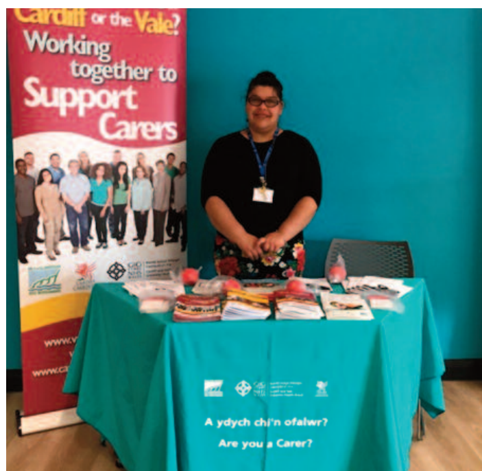
World Mental Health Day, Diverse Cymru Event