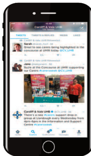
Carers Week Tweet

The aim of all the events was to raise awareness of Carers and the caring roles and to provide information, sign posting and advice to carers. The week was also promoted through social media ensuring we reached as many carers as possible.