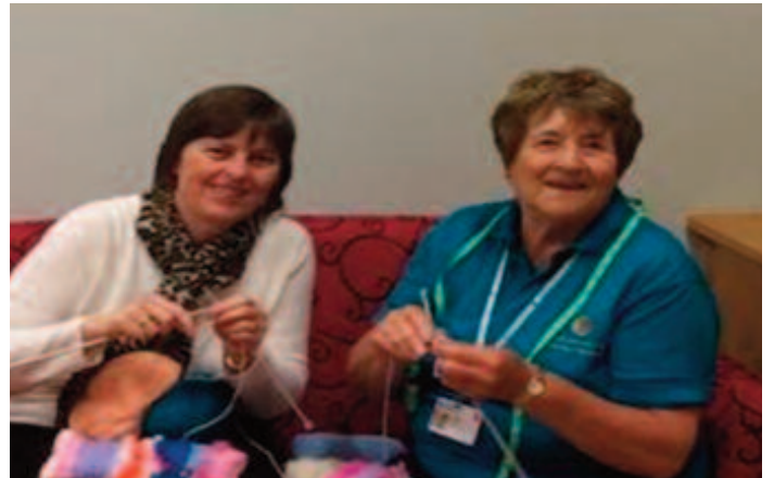
Macmillan Facilitator and Volunteer at Knit and Natter

In addition to support and information given by the mentioned partner organisations a weekly 'knit and natter' group has been launched. Patients, their carers and members of the general public are invited to attend the session and socialise in an effort to reduce social isolation. The sessions have been running since June 2017 and are well attended. It has been noted that since the inception ten known carers have attended the group, along with the person they care for.