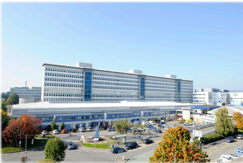
University Hospital of Wales (UHW)

Cardiff and Vale University Local Health Board was established in October 2009, and is the largest Health Board in Wales.