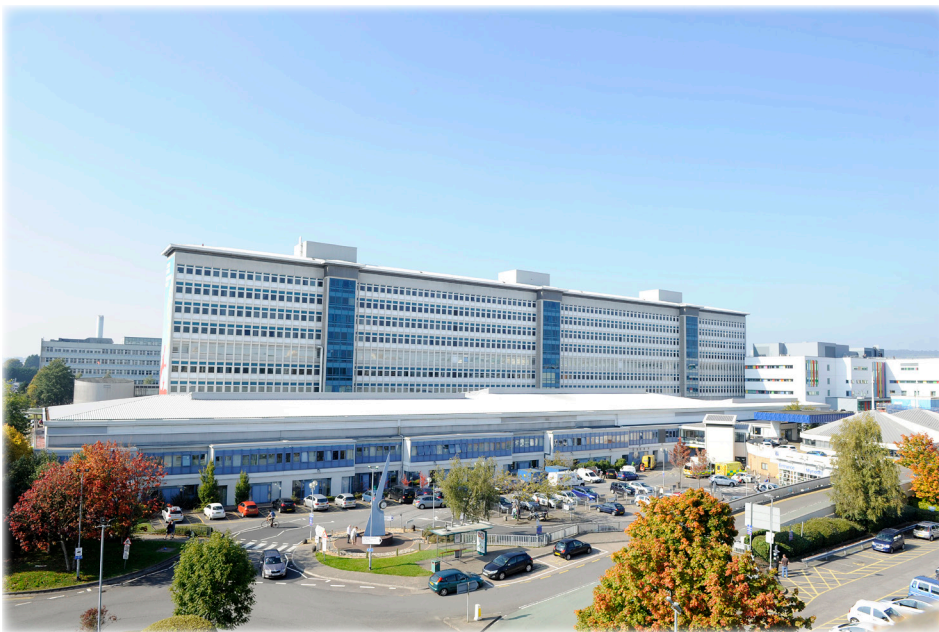
University Hospital of Wales (UHW)

Cardiff and Vale University Local Health Board was established in October 2009, and is the largest Health Board in Wales.