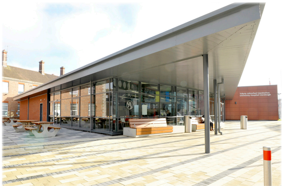
University Hospital Llandough (UHL)

Each centre is managed by a dedicated team who ensure a high standard of Medical Education is provided across the UHB.